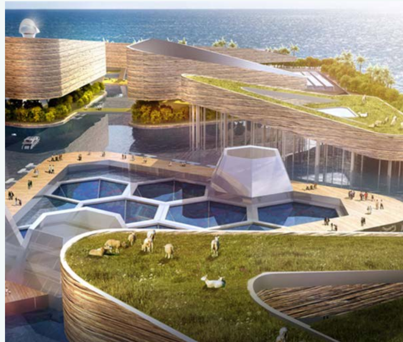
Prefab self-sustaining floating city by AT Design Office