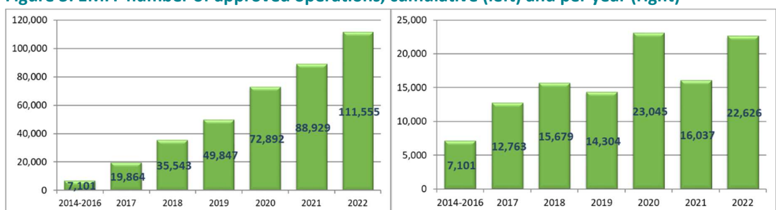
Figure 3: EMFF number of approved operations, cumulative (left) and per year (right)

More than 111 000 operations have already been reported during the 2014-2022 period. The two peak years by number of operations were 2020 and 2022. This is partially explained by the wide introduction of compensation measures (Figure 3).