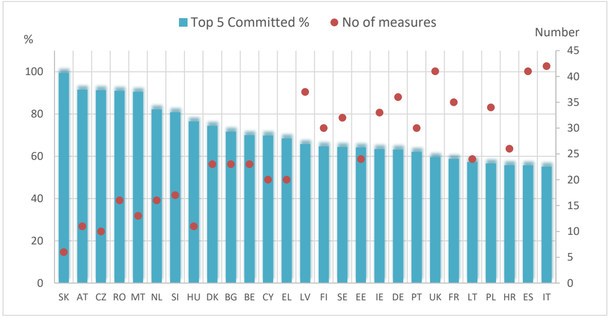
Figure 6: Level of OP diversification (commitments to top five measures as a percentage of total EMFF funding committed, and total number of measures in the OP)

Annex 4 includes a table showing the top five measures by EMFF funding committed for each MS.