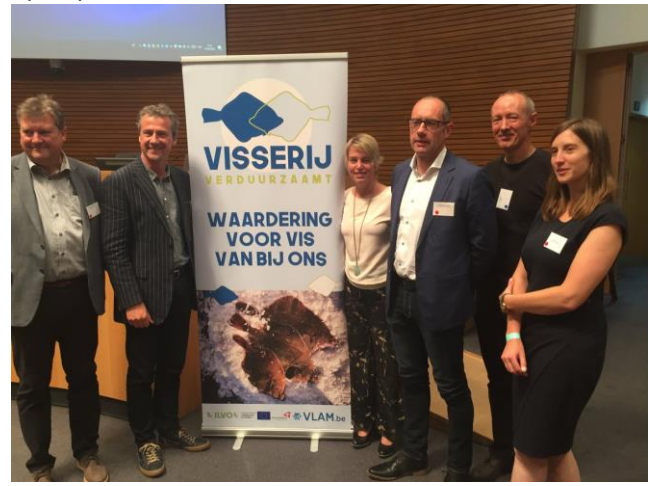
Launch of the Visserij Verduurzaamt in June 2018. Vessels improving their score over 3 years will be awarded this special market recognition.

Participation in VALDUVIS also further streamlines the collection of data from the fleet by the Flemish Government and its provision to the European Commission, adding further value to inform policy decisions and research.