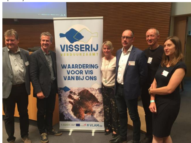
Launch of the Visserij Verduurzaam in June 2018. Vessels improving their score over 3 years will be awarded this special market recognition.

Participation in VALDUVIS also further streamlines the collection of data from the fleet by the Flemish Government and its provision to the European Commission, adding further value to inform policy decisions and research.