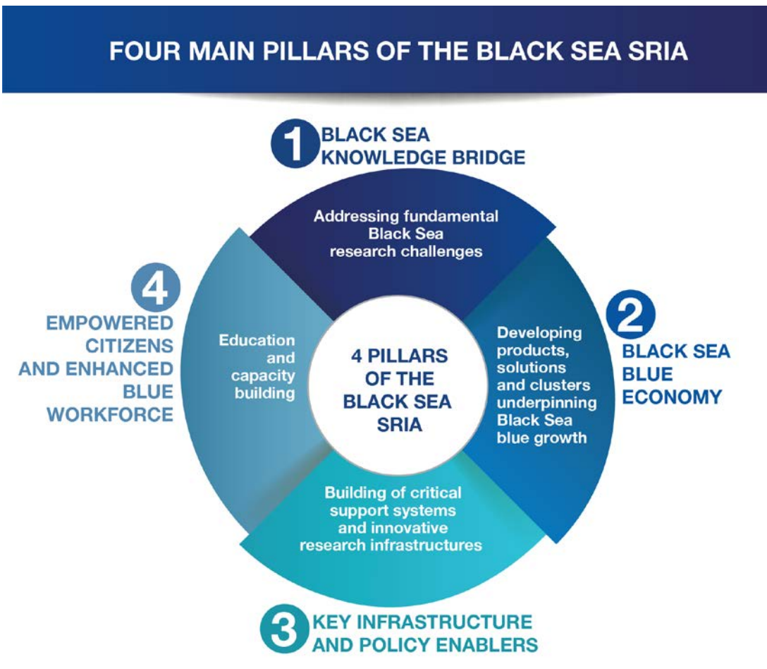
Figure 1 Four main pillars of the Black Sea SRIA based on the Burgas Vision Paper.