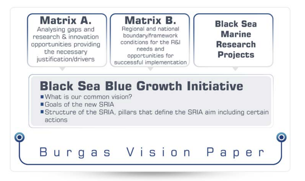
Figure 2 Steps taken to develop the Burgas Vision paper

Eight workshops were held by the experts joining the Blue Growth Initiative for Research and Innovation in the Black Sea with the support of the European Commission (EC) ( Figure 2 ). Initially information on both national and international marine research projects were collected and analysed. Secondly, gaps and research and innovation opportunities together with the necessary justification and drivers from each Black Sea country were collated. Thirdly, regional and national boundary and framework conditions for the Research and Innovation needs and opportunities for successful implementation of a SRIA were identified. Based on the data generated and outcomes of these workshops, the experts of the Initiative drafted: i) common vision, ii) challenges, iii) goals of the SRIA. These results were presented in the Burgas Vision Paper.