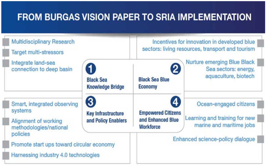
Figure 4 Goals of the SRIA based on the Burgas Vision Paper

As the next steps, work will continue with national-level feedback to define key framework conditions for the SRIA implementation with the contribution of the various stakeholder groups including policy makers, regulatory agencies, researchers, and end users.