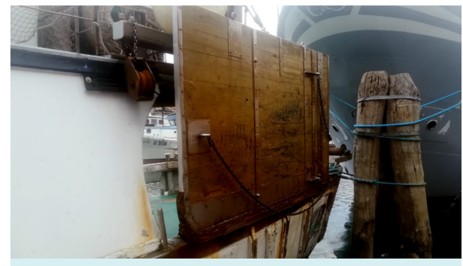
Figure 7: Otter boards with wood panels in use in the Chioggia otter trawl fleet, Italy

The commercially available Dyneema® nets are promoted to be a proven and certified solution to replace steel wire, heavy ropes or outperform low-cost synthetics. They are strong yet light, reducing drag and thereby helping to cut