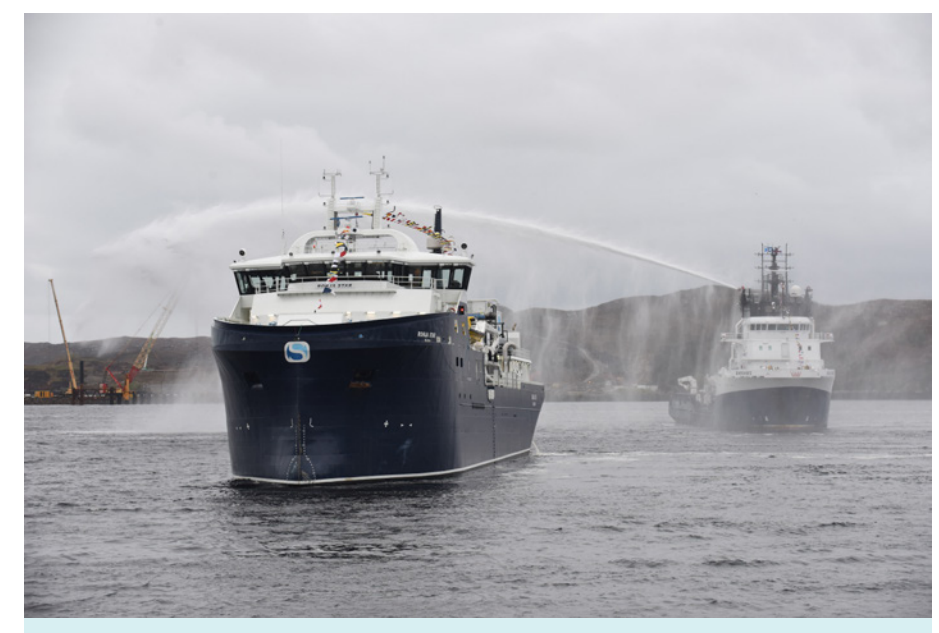
Figure 1: Hybrid aquaculture vessel, Ronja Star

This hybrid electric-diesel fishing vessel was specifically designed to be an innovative fishing vessel to test ground-breaking innovations in practice. The special shape of the ship and the diesel electric propulsion provide 60% fuel and CO2 savings compared to similar-sized fishing vessels.