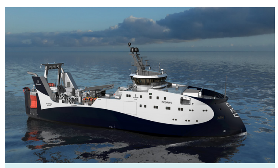
Figure 9: EcoFive vessel design

Examples of similar innova tions for new vessels were presented at the Nor-Fish-