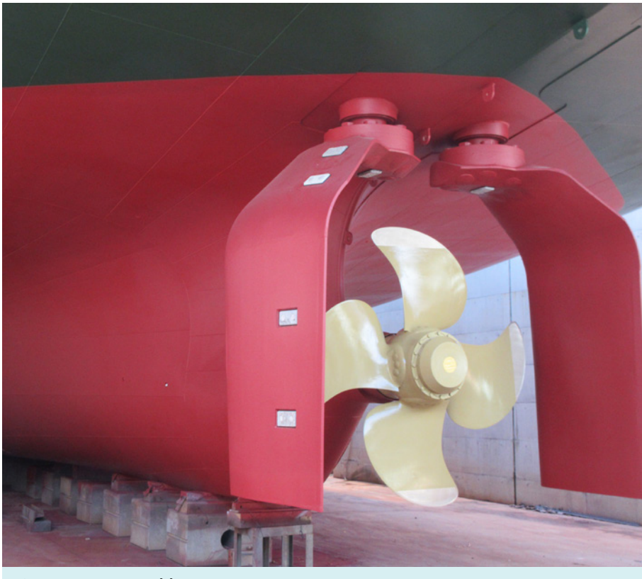
Figure 8: Gate Rudder System

The Horizon 2020 SeaTech project <sup>165</sup> aims to develop a renewable-energy-based propulsion innovation consisting of a bio-mimetic dynamic wing mounted at the ship