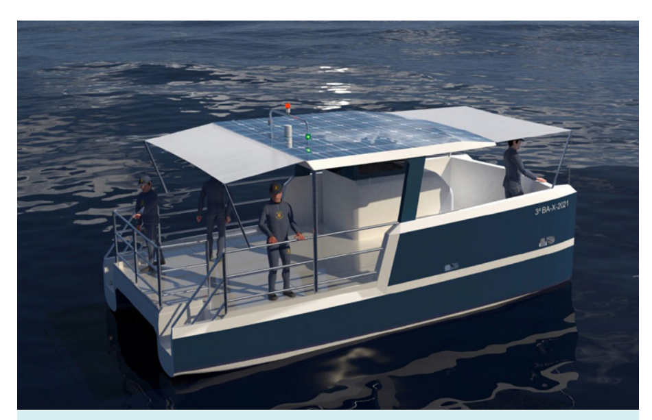
Figure 4: Design for solar-powered fishing catamaran

sity of Barcelona.<sup>102</sup> In addition to being silent, the annual reduction in CO2 emission reaches 1 600kg.