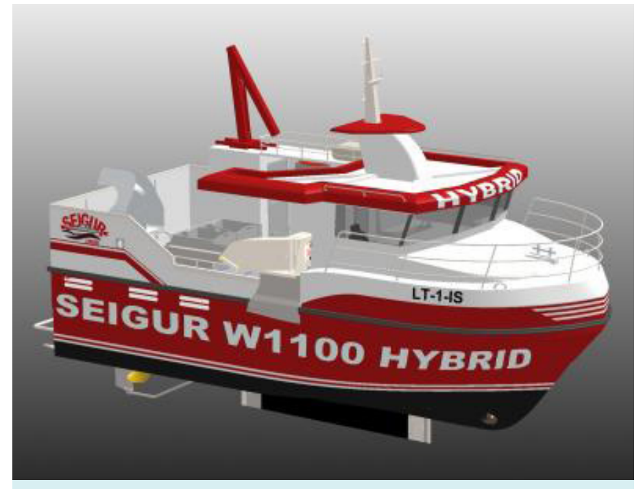
Figure 2: Seigur W1100 Hybrid fishing vessel

This hybrid system will be used in conjunction with a diesel engine plus 400 Ah battery bank, which can be recharged by the regeneration system of the hybrid system or with the onboard generator. With the special transmission, it is possible to integrate diesel engine power with the hydraulic and electric utilities on board and to cruise at approximately 8 knots in electric mode.