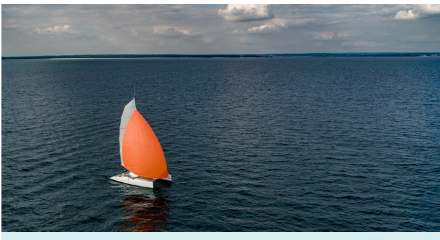
Figure 5: Project Skravik's second-hand catamaran turned into a fishing laboratory

The vessel is tested under real fishing conditions with traps, longlines, lines and nets in the maritime territory of Brest, France. It is also the intention to transfer experiences and