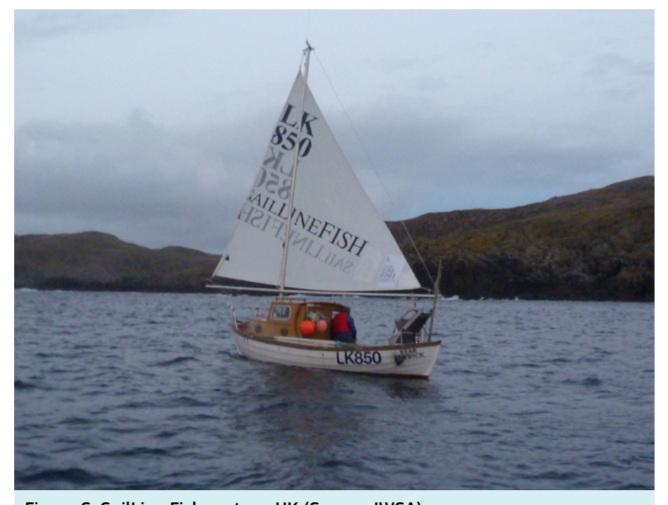
Figure 6: SailLine Fish system, UK