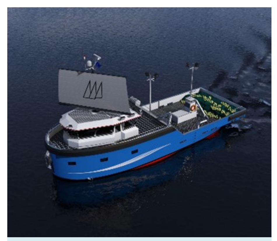
Figure 3: Project "Sailfish" wind-assisted fishing vessel

Another project is looking at the design of a fishing catamaran that would use solar panel for an electricity engine. The selected vessel is of 8 m length from an artisanal fisher collaborating with a research group of the Nautical Univer-